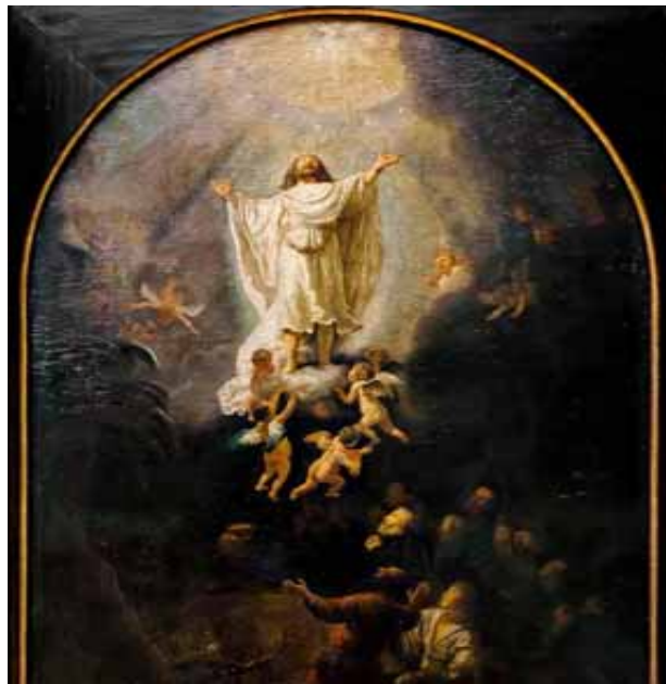
The Ascension of Christ, Rembrandt 1636